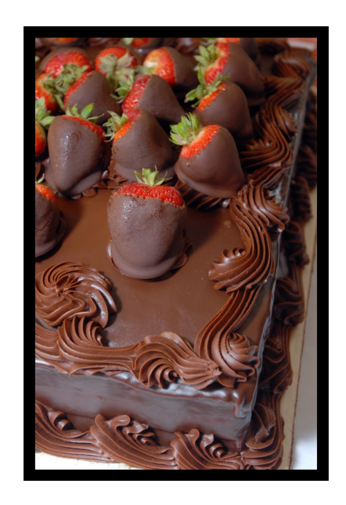
Cake 24 Chocolate Cake with chocolate mousse filling, chocolate ganache icing and chocolate dipped strawberries 1/2 sheet 2 layer; 75-80 servings - $123.20 1/4 sheet 2 layer; 35-40 servings - $59.20 $1.60 per serving