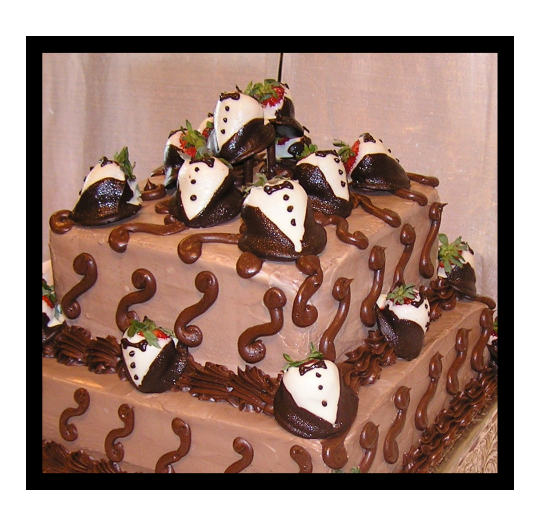
Cake 23 Chocolate Cake with Chocolate Icing decorated with scroll designs and tuxedo design chocolate covered strawberries 9"-12" Square 100 servings - $160.00 $1.60 per serving