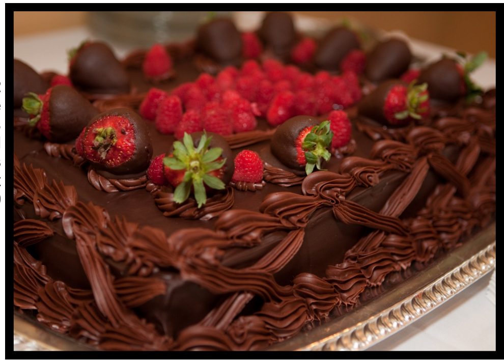
Cake 22 Cheesecake with Chocolate Ganache Icing fresh berries and chocolate dipped strawberries 1/2 sheet 80-90 servings - $297.50 $3.50 per serving