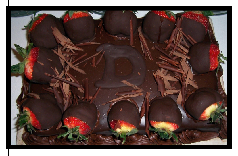
Cake 25 Chocolate cake with chocolate mousse filling, chocolate ganache icing, chocolate initial, chocolate shavings, and chocolate dipped strawberries

1/2 sheet 2 layer; 75-80 servings - $123.20 1/4 sheet 2 layer; 35-40 servings - $59.20 $1.60 per serving