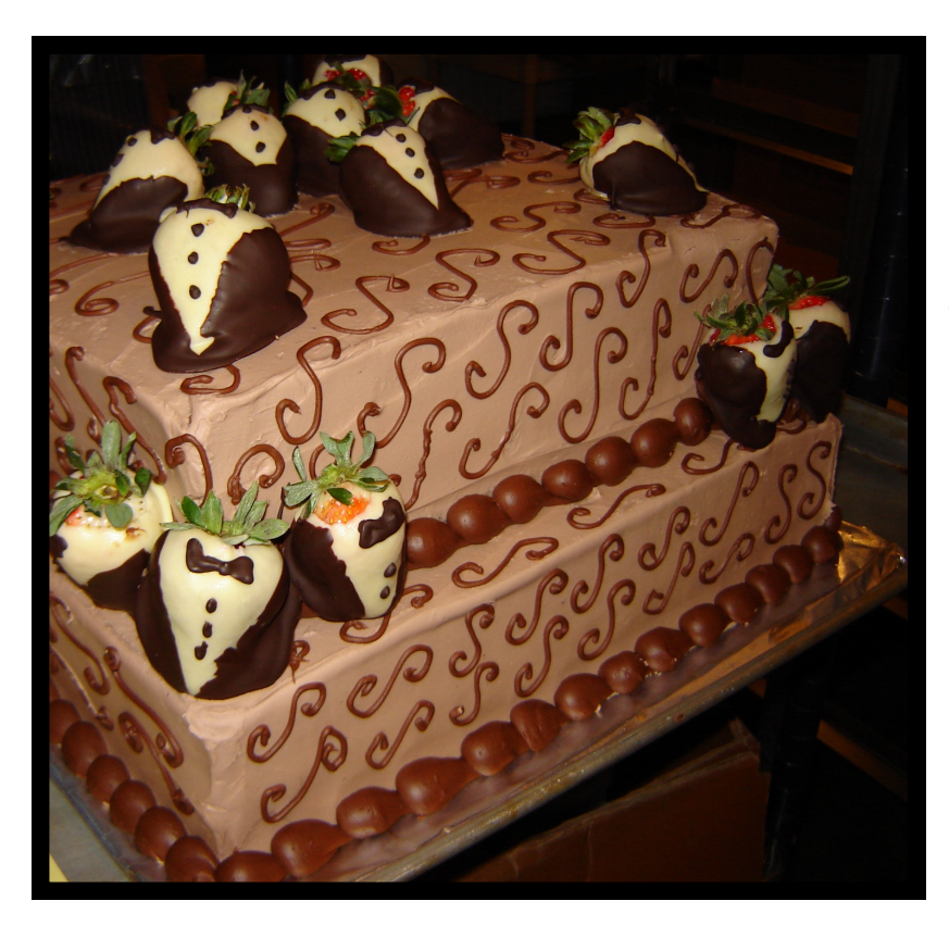
Cake 21 Cheese Cake with Chocolate Icing decorated with scroll designs and tuxedo design chocolate covered strawberries 9"-12" Square 100 servings - $350.00 $3.50 per serving